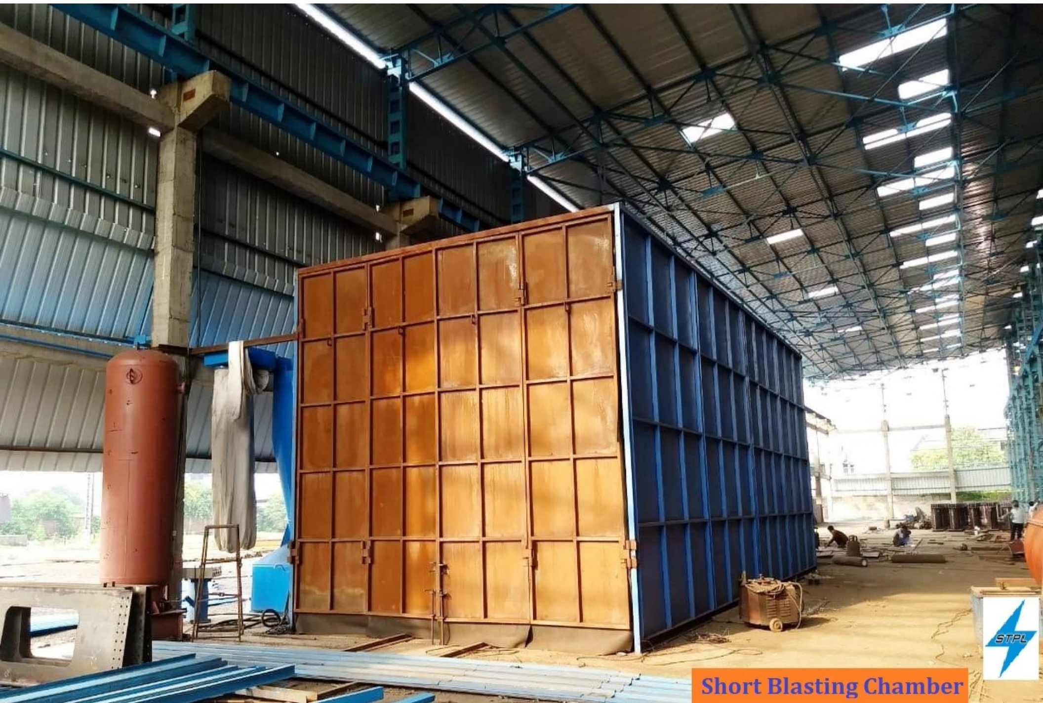
Short Blasting Chamber